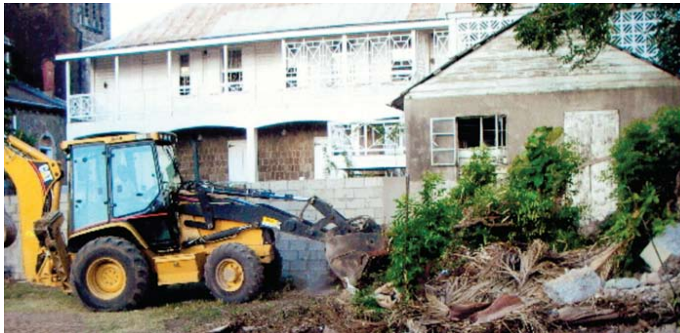
Right, construction of the expanded playground area; the finished Laurie Mezzalingua Resource Center, opposite page