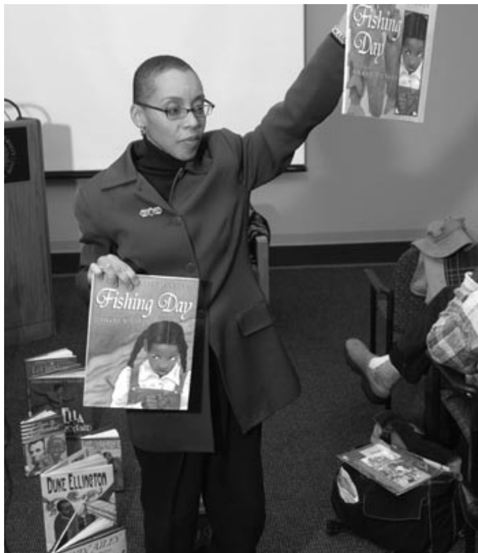
Andrea Davis Pinkney '85 at the Schine Student Center